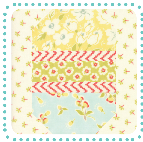
Finished block size: 6" x 6"